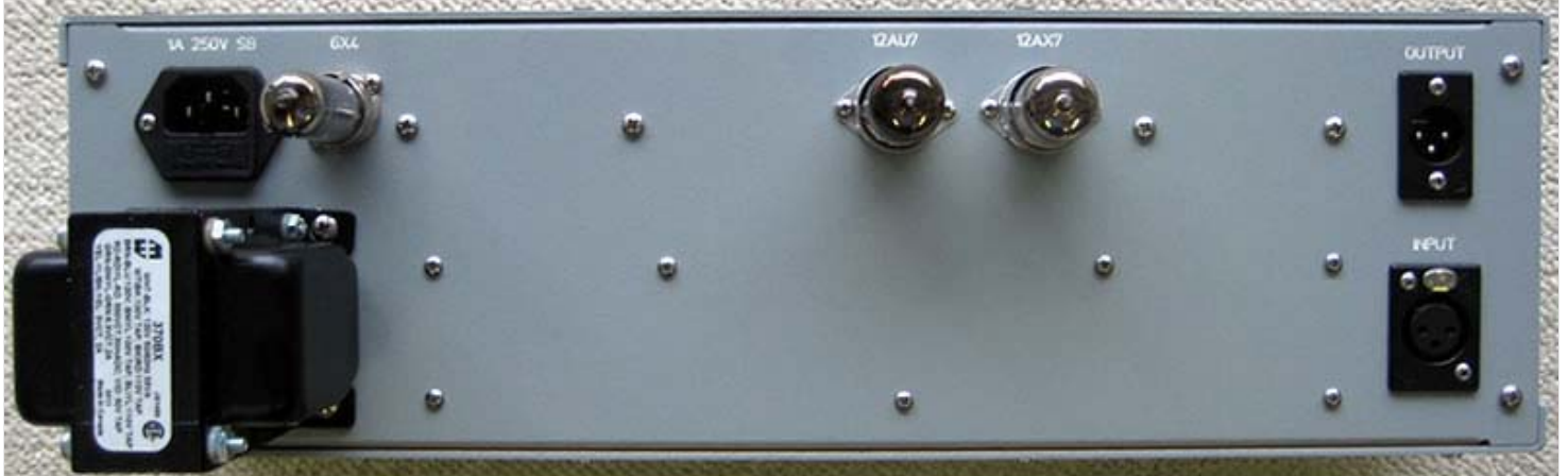
Pultec Chassis and Hardware Detail